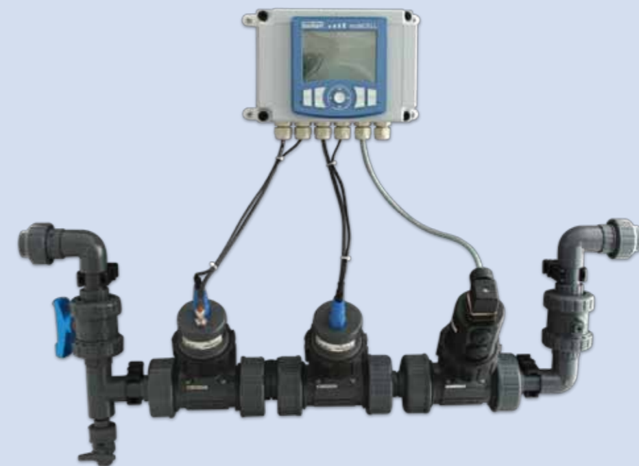
multiCELL as multivariable measurement transmitter